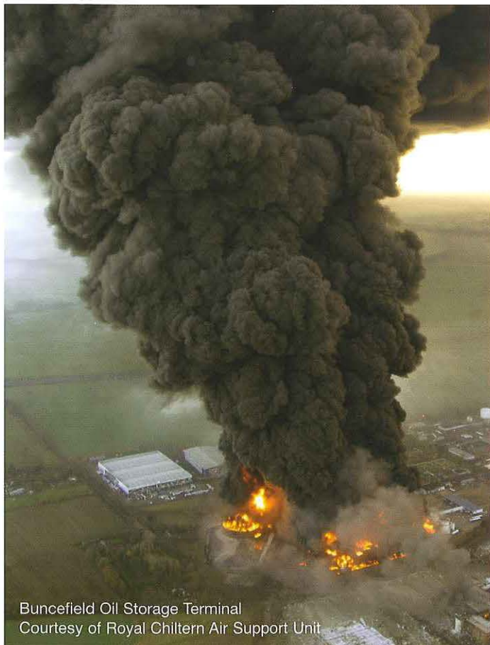
Buncefield Oil Storage Terminal

Why are you playing Russian roulette with your Business by not having a Business Continuity Plan? It really isn't a case of if an incident happens but rather when.